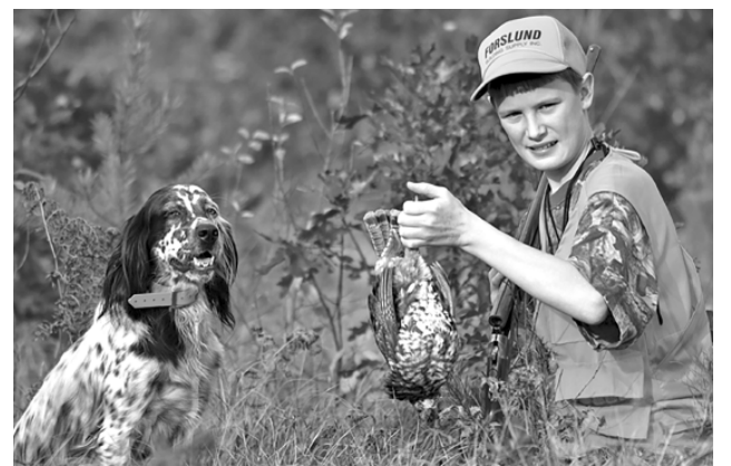
The Michigan Department of Natural Resources encourages new hunters to sign up now for a safety course. Hunter education classes are conducted year-round but usually are filled to capacity from August through October.

Michigan Department of Natural Resources conservation officers remind new hunters that it's not too early to sign up for safety classes.